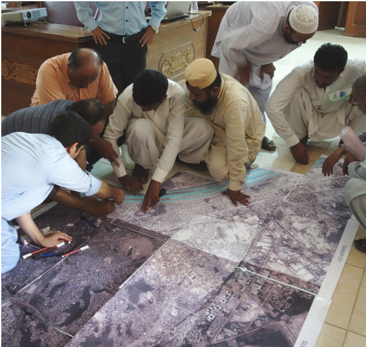
Mapping activities in Sindh, Pakistan.

for immunisation service delivery highlight the need for a clear enabling environment that covers aspects such as governance and leadership, policies, data specifications and protocols, technical capacities and resources to support the sustainable use of geography as a unifying dimension in a national health information system (HIS). These foundations form the basis for powerful changes that can impact immunisation programme implementation and contribute to increasing in the number of fully-immunised children globally. In the context of the Covid-19 pandemic, the accelerated development of tools for data sharing and collaboration between remote locations using the common language of geography is more important than ever to advance the delivery of immunisation services.