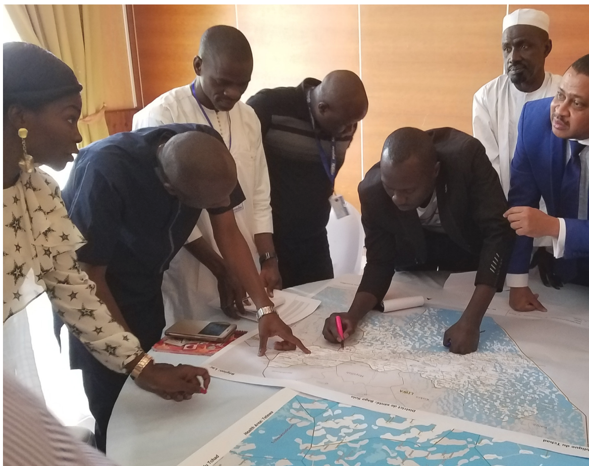
Mapping activities in Chad.

System Centre 1 in Brazzaville, Congo and the Health GeoLab Collaborative in the Asia/Pacific region. 2 Both provide technical support for the management and use of geospatial data and technologies in health programming and opportunities to share experiences and expertise. Recent workshops for regional sharing of experiences and best practices in using geospatial technologies for immunisation and other health programmes have resulted in important guidance, capacity assessments and case studies (UNICEF, 2017; UNICEF, 2018a; AeHIN, 2017).