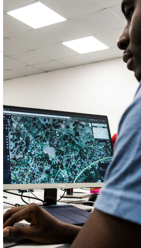
Cameroon monitoring activities

Modelled estimates of multi-national vaccination coverage are explored and described in a number of publications, using geolocated Demographic and Health Survey (DHS) clusters of vaccination indicators with covariates such as population density, poverty, or climate to create geospatial models of immunisation coverage (Utazi et al., 2018; Utazi et al., 2019; Takahashi et al., 2017; Takahashi et al., 2015; Mosser et al., 2019). While these modelled estimates contain inherent uncertainties, they are useful